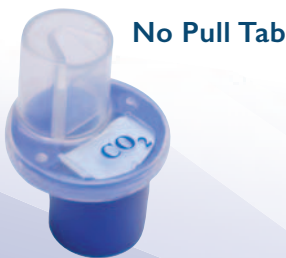
Neo-StatCO 2 <Kg ® CO 2 Detector For patients within 0.25 kg - 6 kgs body weight

Red Pull Tab for better visibility activates device