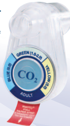
StatCO 2 ® CO 2 Detector For patients over 15 kgs body weight