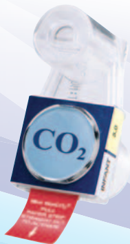
Mini StatCO 2 ® CO 2 Detector For patients within 1 kg - 15 kgs body weight

Red Pull Tab for better visibility activates device